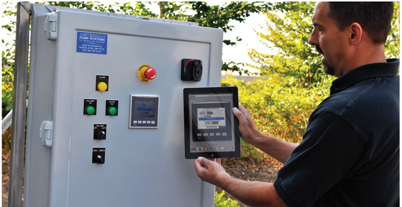
iRover Mobile HMI on iPad2 operating a MeterMan PolyMan Sr. equipped with a Unitronics v350

By turning an Apple iPad into the HMI of a PLC, we are able to unchain ourselves from standing in front of the control panel. This is what we call "Onsite Mobility". Onsite Mobility allows the operator to move freely, while being connected to the PLC. It allows the user to move out of inclement weather or direct sunlight that washes out stationary screens, rendering them useless. With iRover the user can move away from the control panel and closer to the process being controlled while maintaining the ability to fully control the PLC. It's like taking the PLC with you.